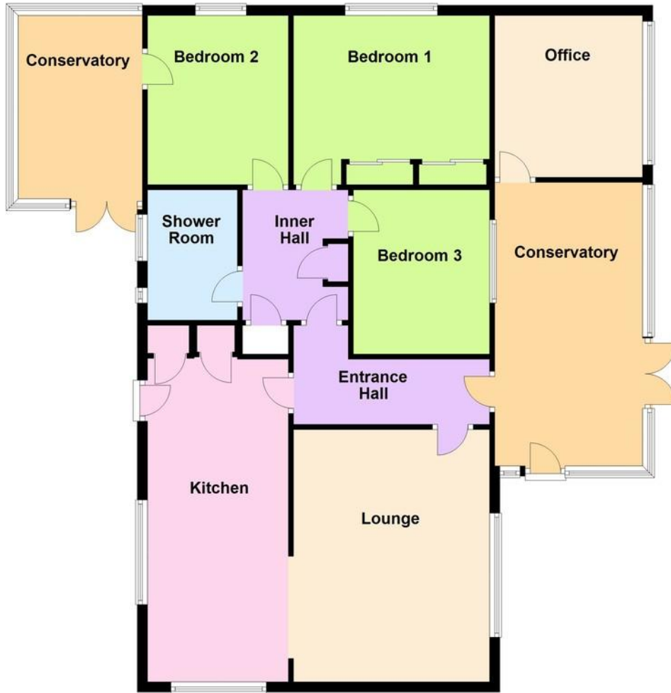
Total area: approx. 123.0 sq. metres (1323.6 sq. feet)