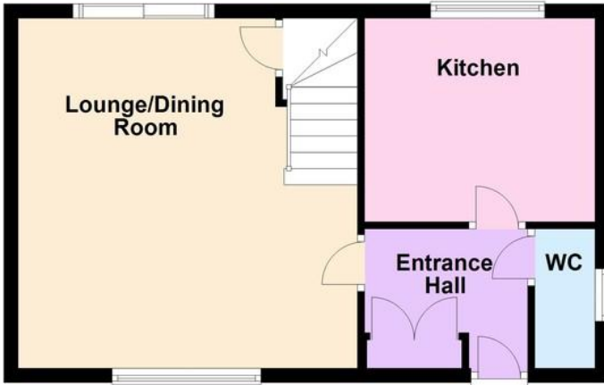
Ground Floor Approx. 40.1 sq. metres (431.8 sq. feet)